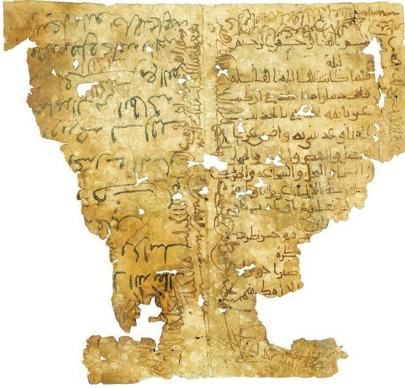
Oriental Institute (Chicago), no. 17618 (9 th cent) oldest known fragment of 1001 Nights